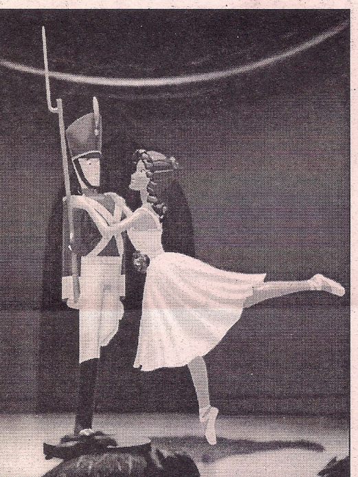
life at midnight. This sequence features Dmitri Shostakovich's Piano Concerto No. 2 with Yefim

Fantasia 2000, a continuation of Walt Disney's 1940 masterpiece, perpetuates Walt's dream for an everchanging and evolving Fantasia. It is comprised of three pieces from the original Fantasia as well as six new sequences which are currently in production at